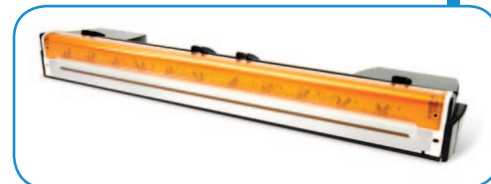
Memjet® print head has 70,400 ink nozzles for higher speeds, lower ink use and less noise than standard print heads