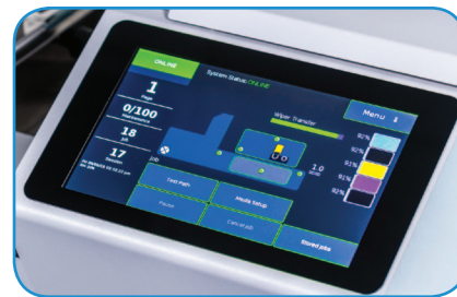
Intuitive 7" color touchscreen displays system status, image preview, and provides access to stored jobs