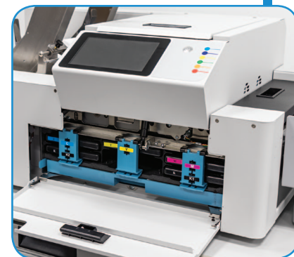
Clamsell design offers easy front access to ink tanks and paper path